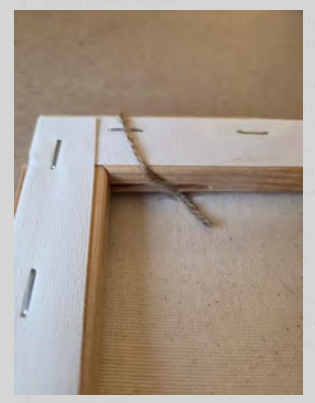
Step 4: Anchor one end of twine on the back side of the canvas with tape or glue. Wrap the remaining length around the canvas, crossing at random. Secure the other end on the back and trim any excess. Add clothespins to hold a photo or simply tuck the photo behind twine. The twine wrap should allow for vertical or horizontal orientation of photos by moving clothespin as needed.