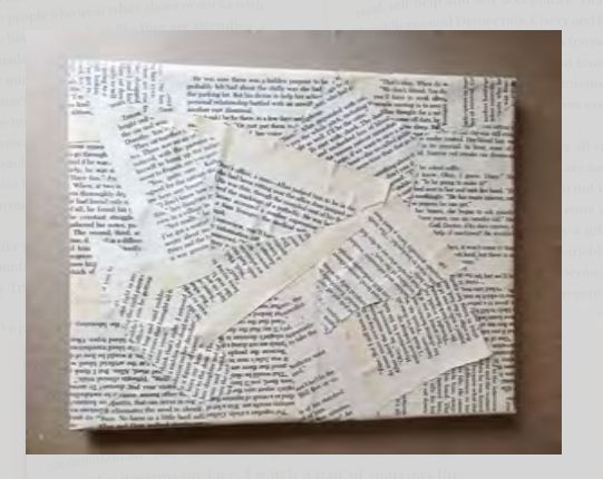
Step 3: Apply a thin layer of Mod Podge over the entire canvas covering book pages and including edges to seal it. Allow to dry completely.